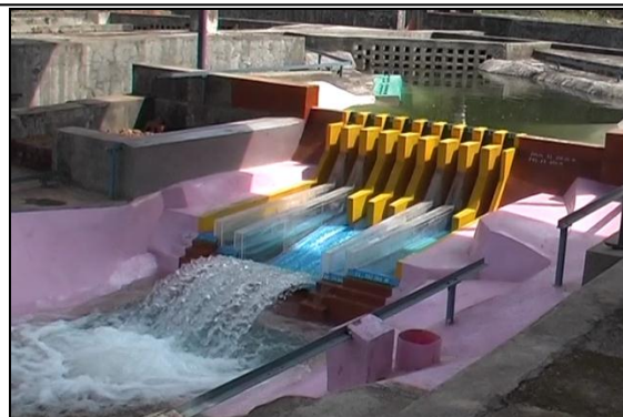
Modified Design as per DDRP recommendations